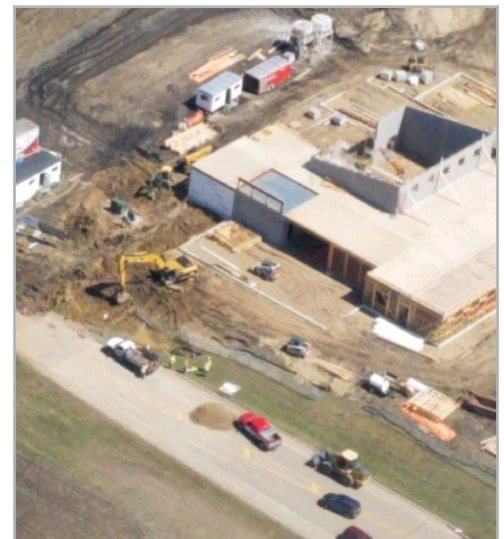
A view from the sky: ELC - Montevideo