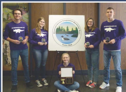
1st Place MCC I