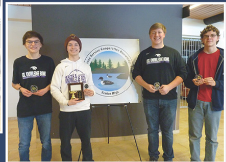
3rd Place GSL Purple