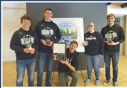
1st Place GSL Black