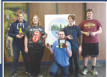
3rd Place Wabasso