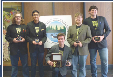
2nd Place Worthington I