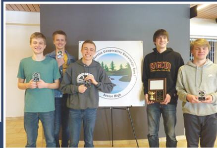
2nd Place Hutch I